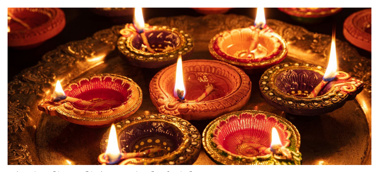
a) Diwali - India's Festival of Lights:

Festivals are the heartbeat of a culture, pulsating with energy, colors, and an unparalleled sense of unity. Each region boasts its own unique festivities, steeped in tradition and history. Let's explore a few remarkable examples: