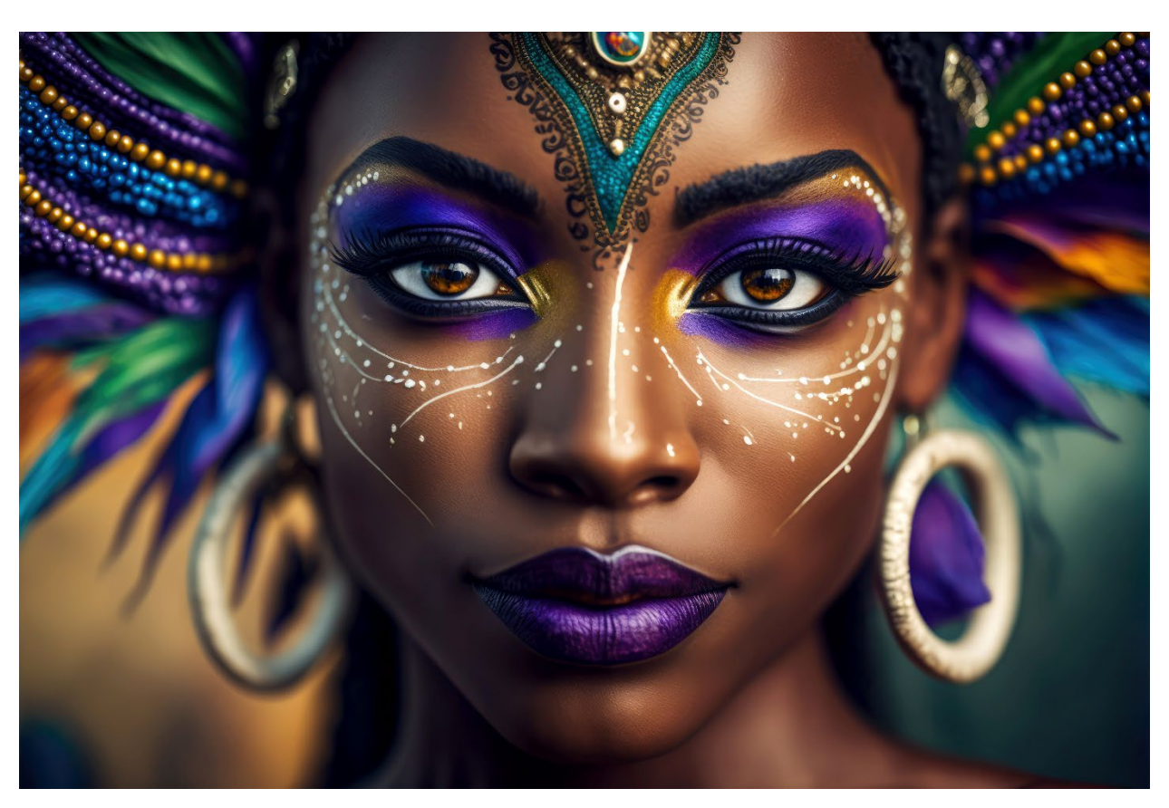
b) Carnival - Brazil's Extravaganza of Samba and Color:

Diwali, also known as Deepavali, is a mesmerizing Hindu festival celebrated with great enthusiasm and joy. It symbolizes the victory of light over darkness and good over evil. Witness the streets adorned with flickering oil lamps, the sky illuminated with dazzling fireworks, and families coming together to exchange sweets and gifts. Dive into the cultural significance of Diwali and immerse yourself in the spirit of this vibrant festival.