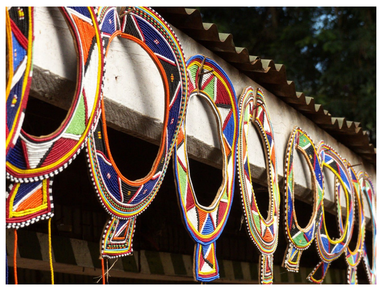
b) Maasai Beadwork - Kenya and Tanzania's Vibrant Craftsmanship:

The Maasai people of Kenya and Tanzania are renowned for their intricate beadwork, a craft passed down through generations. Admire the vibrant colors and geometric patterns that adorn jewelry, clothing, and decorative items. Each bead carries symbolic meaning, reflecting the Maasai's traditions, social status, and spirituality.