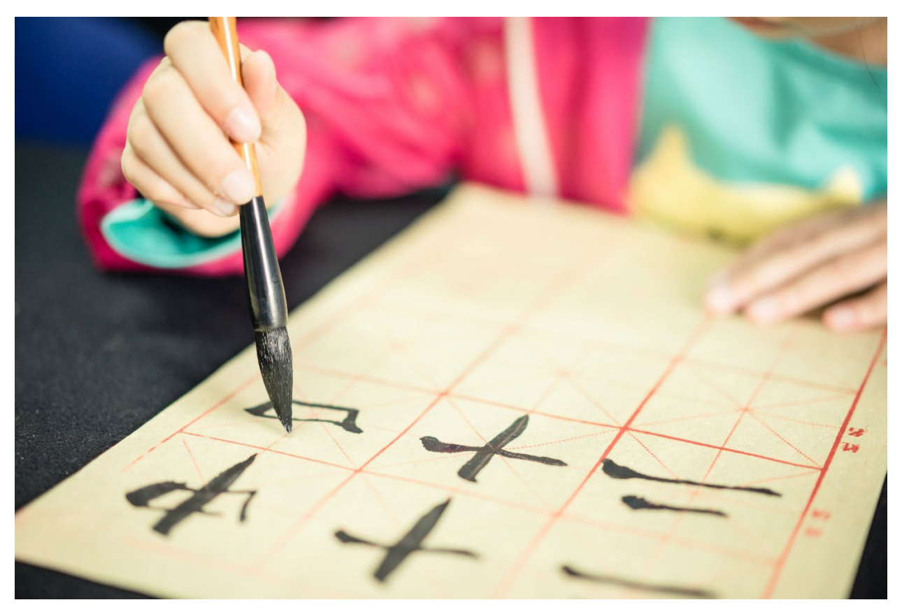
c) Chinese Calligraphy - The Elegance of Brushstrokes:

Chinese calligraphy is an ancient art form that combines skill, precision, and poetic expression. With a single brushstroke, calligraphers convey beauty, balance, and harmony. Explore the graceful curves and intricate characters that embody the essence of Chinese culture and learn about the deep-rooted symbolism behind each stroke.