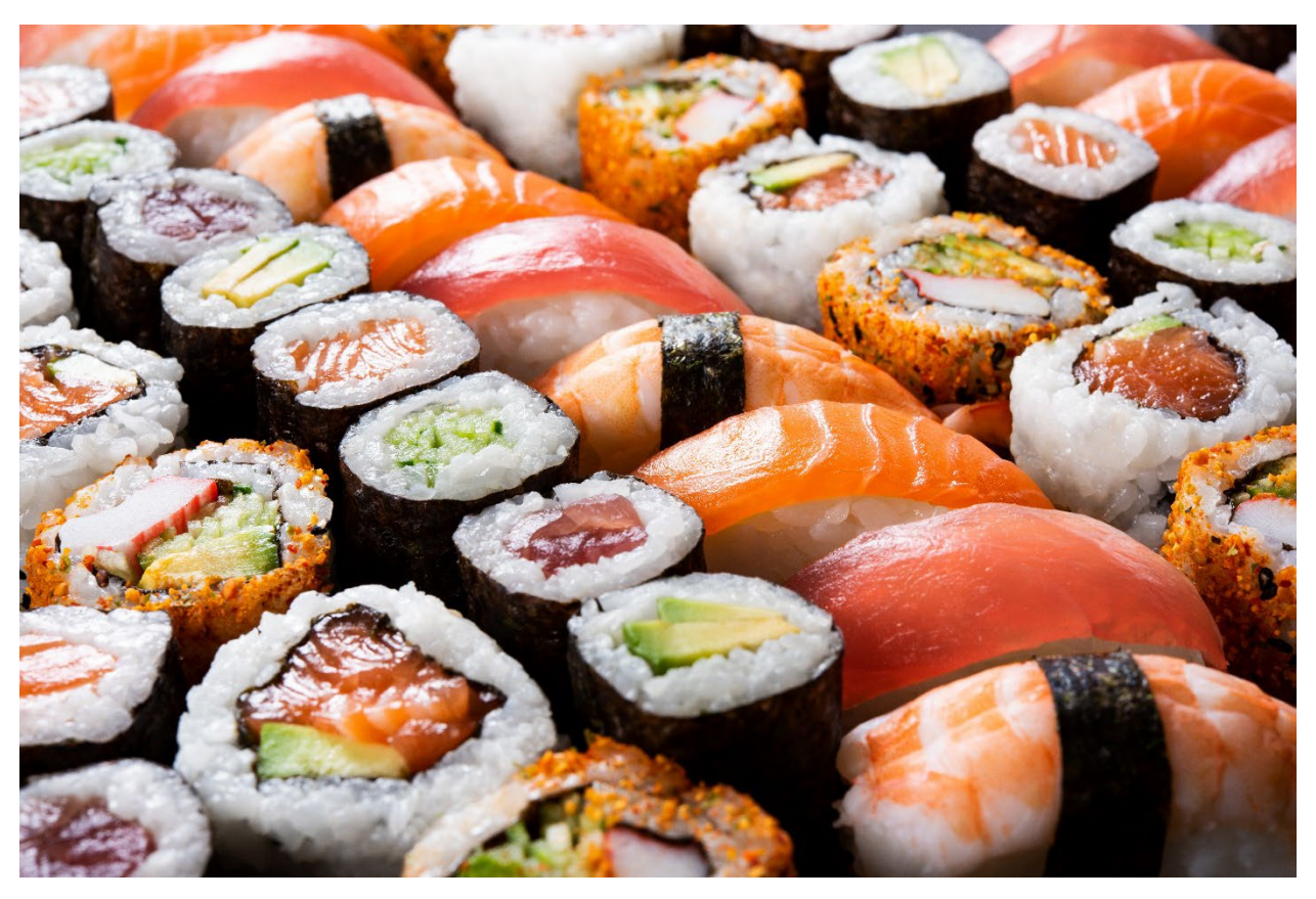
a) Sushi - Japan's Art of Delicate Perfection:

Sushi, Japan's iconic dish, is not just a meal but an art form that tantalizes both the eyes and the taste buds. Experience the meticulous craftsmanship as sushi chefs skillfully prepare bite-sized pieces of fresh fish, delicately arranged on vinegared rice. From the traditional nigiri to the avant-garde creations, sushi is a testament to Japan's culinary excellence.